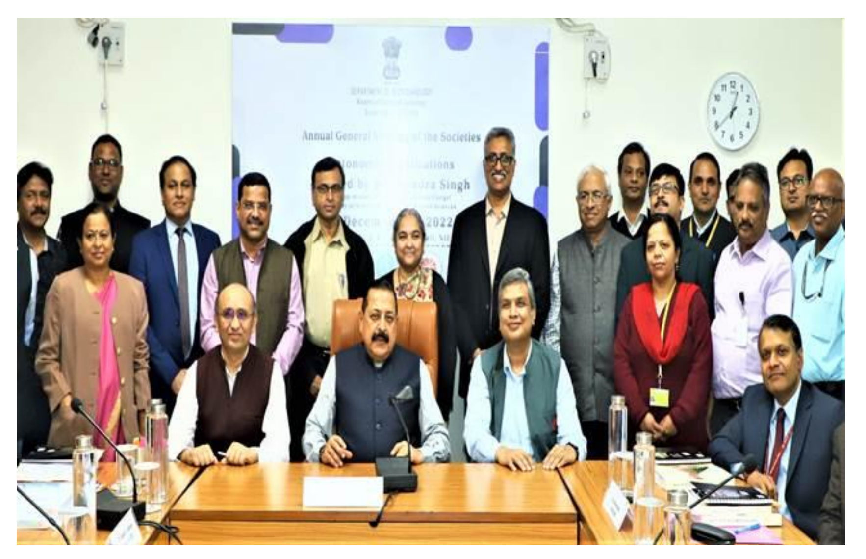
increase collaborations with clinicians through joint internship and MD programmes. Heads and Directors of Rajiv Gandhi Centre for Biotechnology (RGCB), Thiruvananthapuram, Centre for DNA Fingerprinting & Diagnostics, (CDFD),